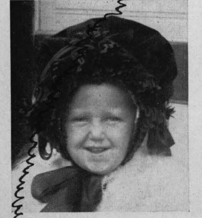
The posesses a talent for tying.